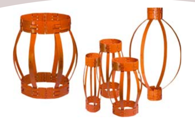
Bow Spring Casing